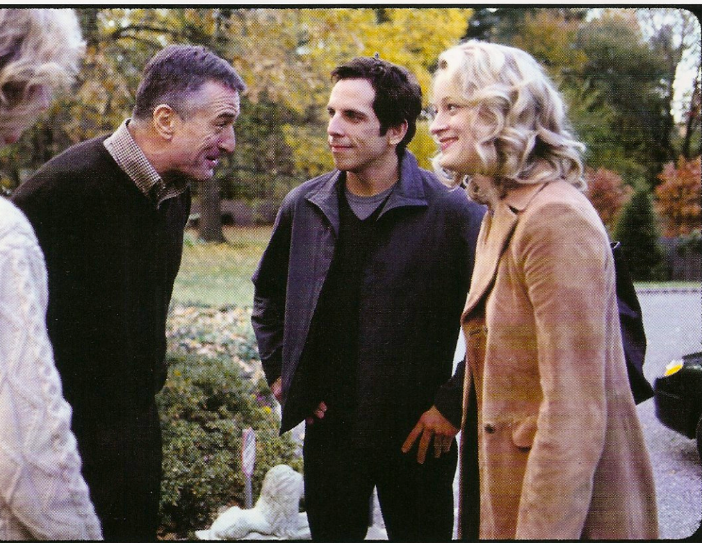
Meet The Parents

Ben Stiller’s career choice, a nurse, is the subject of laughs in “Meet the Parents.”